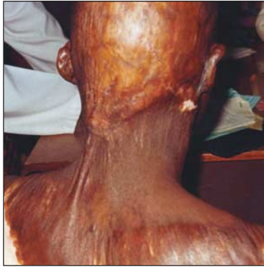
Figure 8. Type 4a contracture.