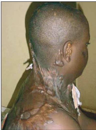
Figure 10. Type 4c contracture.

In type 3b ( Figure 7 ), the contractural segment has insufficient supple neck skin to cover the reconstructed defect. Twenty-two (54%) of those in the review fall into this group.