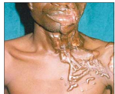
Figure 3. Type 1b contracture.