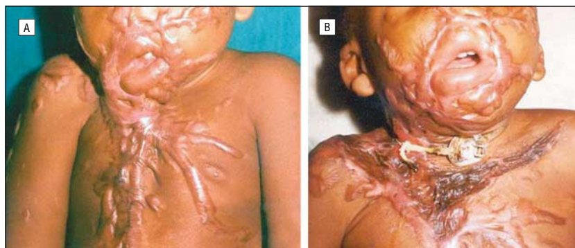
Figure 6. Type 3a contracture.