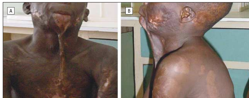
Figure 2. Type 1a contracture.