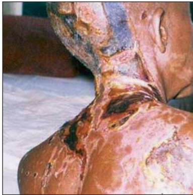
Figure 9. Type 4b contracture in an elderly woman burned by a corrosive substance.