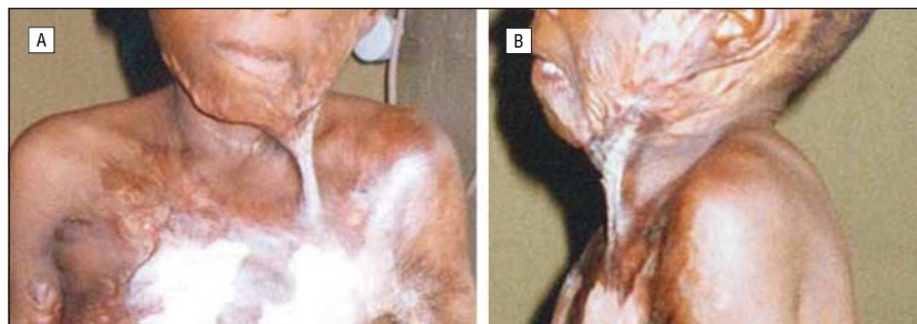
Figure 4. Type 2a contracture.